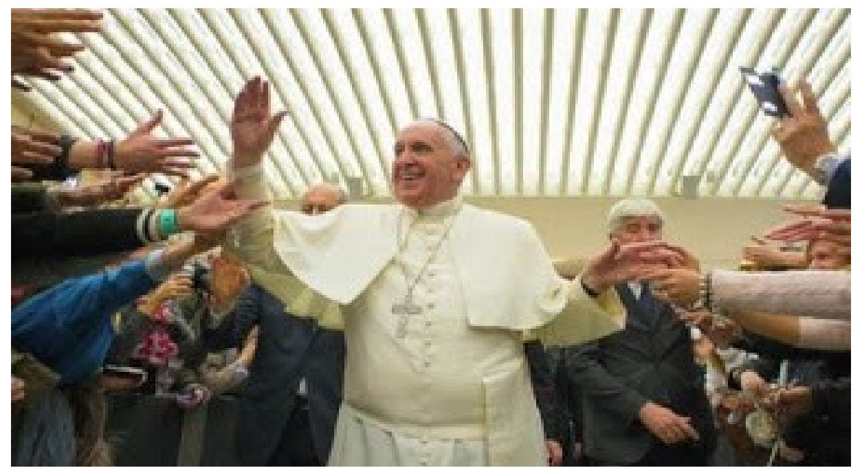
Pope Francis is to visit the US on 23rd September 2015. He will visit the White House and then address the US Congress on the 24th September. Could we be witnessing the prophet of the Anti-Christ, the false prophet?

Pope Francis Addresses the United States Congress Sept 24, 2015