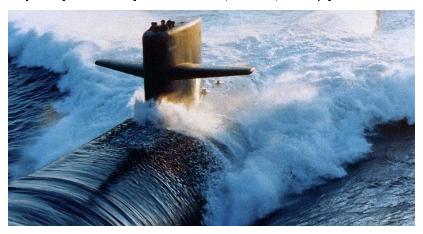
A Stone's Throw Away From Alaska: Russian Nuclear Sub en Route to Kamchatka Base

The unmanned underwater vehicle, or UUV, will be equipped with megaton-class warheads that could potentially blow up "key ports used by US nuclear missile submarines" in places such as Kings Bay, Georgia and Puget Sound in Washington State, the Defense Department was quoted as saying.